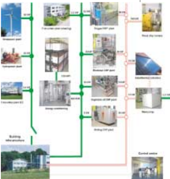
Process flow chart of the Energy Park

Even at present, a number of interesting results have already become available. The successful use of the Energy Park as a demonstration plant has resulted in several term papers and diplom dissertations, as well as the accessibility to a large number of visitors and visiting groups. The establishment of this regenerative energy supply system has proved to be quite unique in Germany and beyond the national borders. Besides continuous improvement and upgrading of the system, increasing research is in progress for continuing development. (si)