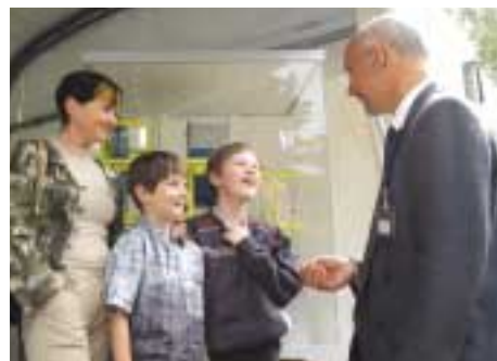
Even the young "experts" demonstrated great interest in CUTEC know-how

In his speech at a reception held in the course of the Environment Week, the President emphasised that the search for alternatives to the limited fossil energy resources is of paramount importance nowadays for ensuring an adequate supply of energy to future generations. (ge/he)