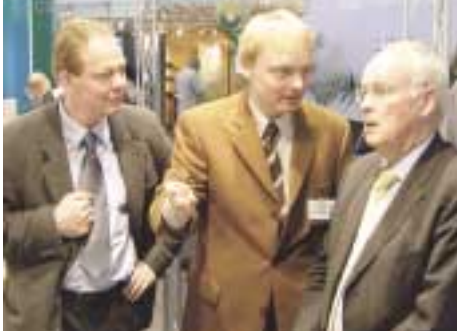
Minister of the Environment Sander (right), speaking with the specialists from CUTEC

In April CUTEC was represented for the first time with its own stand at the Hannover Industrial Fair. On the one hand, a model of the Clausthal Energy Park was presented at the CUTEC stand in Hall 13 (Energy). The purpose of this plant is to ensure the supply of electric power and heat to the CUTEC building from a combination of renewable energy sources