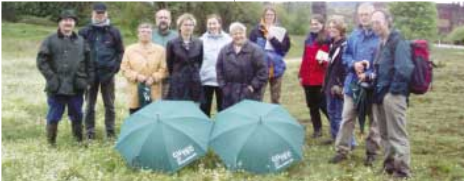
Well equipped with umbrellas during the CUTEC excursion

Good weather-proofing was an absolute prerequisite during an excursion by geologists, botanists, and other participants in the project, "Network Phytoextraction", in our region in May 2004. Subsequent to their second project meeting, this excursion led them to contaminated areas at various locations in the Harz Mountains and foreland (see following figure). Special attention was paid to areas contaminated with heavy metals, which have resulted from more than 1000 years of mining activity. With its various mining districts, the Harz Mountain Region is a prime example of intensive utilisation effects. This area was an especially important industrial centre of the early Modern Age, and the consequences of ore mining, dressing, and further processing are therefore evident everywhere.